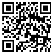
Students Counseling Center

If you have any questions, please ask the Student Affairs Division.