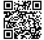
Student Life Guidebook

Thank you for your attention. (Please be sure to read the Student Life Guidebook.)