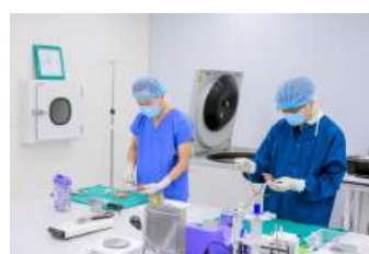
Research Institute of Stem Cell & Gene Technology