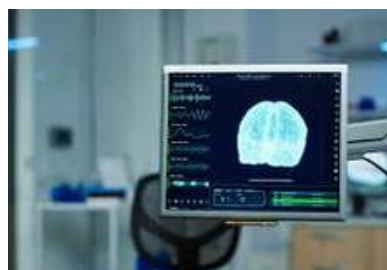
VinUni-Illinois Smart Health Center ( https://smarthealth.vinuni.edu.vn/ )