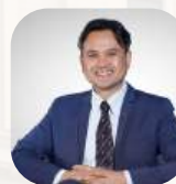
Stanford University Le Van Phouc College of Health Sciences