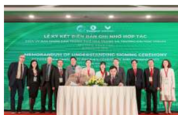
Agile Innovation Center (AIC) ( https://aic.vinuni.edu.vn/ )