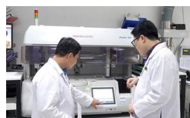
Vinmec-VinUni Institute of Immunology