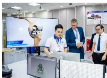
3D Technology in Medicine Center