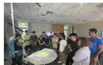
Research Assistants with VinUni Faculty

(*) The availability of internship positions will be based on the current demand of research projects.