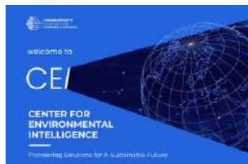
Center for Environmental Intelligence ( https://cei.vinuni.edu.vn/ )