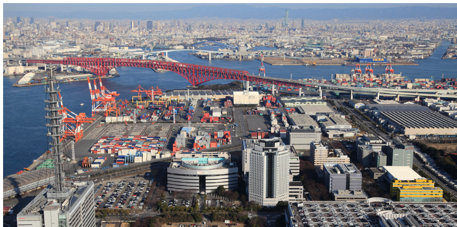
The majority of Osaka Bay area is built on reclaimed land

Director of Urban Research Plaza, Osaka City University Kwansei Gakuin University Setsunan University Ryukoku University Deputy Mayor of Sakai City Saitama University Vice President of Osaka City University Osaka City University Fukuoka University Chief Administrative Officer, Osaka City University Kwansei Gakuin University Mayor of Minato Ward, Osaka City Mayor of Kita Ward, Osaka City Former Director of Port & Harbor Bureau, Osaka City Ryukoku University