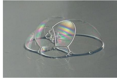
multi-bubble on a plane

We call the edge of the set which touches another object is called the junction. On the junction part, energy is expected to be concentrated and is an interesting target for analysis. Especially, we will treat kinetic feature of junction motion. For example, we want to analyze how detergent bubble act on cleaning up process.